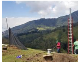
Fog catchers in the mountains of Costa Rica

The Penelope Gandhi Mission is a project carried out by the University of the Mountains , a member of the Mountain Partnership, to support the protection and revitalization of the traditional Greek art of weaving. The University of the Mountains is a voluntary organization