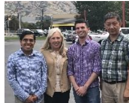
MP members prepare for Global Meeting

Mountain ecosystems in Costa Rica are factories of water. In July 2016, the Environmental Unit of the Municipality of La Union, Costa Rica managed the project "Promoting and facilitating the integrated and sustainable management of the upper region of the