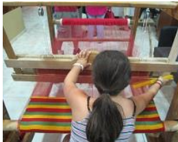
Revitalizing an ancient tradition in Crete

The Penelope Gandhi Mission is a project carried out by the University of the Mountains , a member of the Mountain Partnership, to support the protection and revitalization of the traditional Greek art of weaving. The University of the Mountains is a voluntary organization